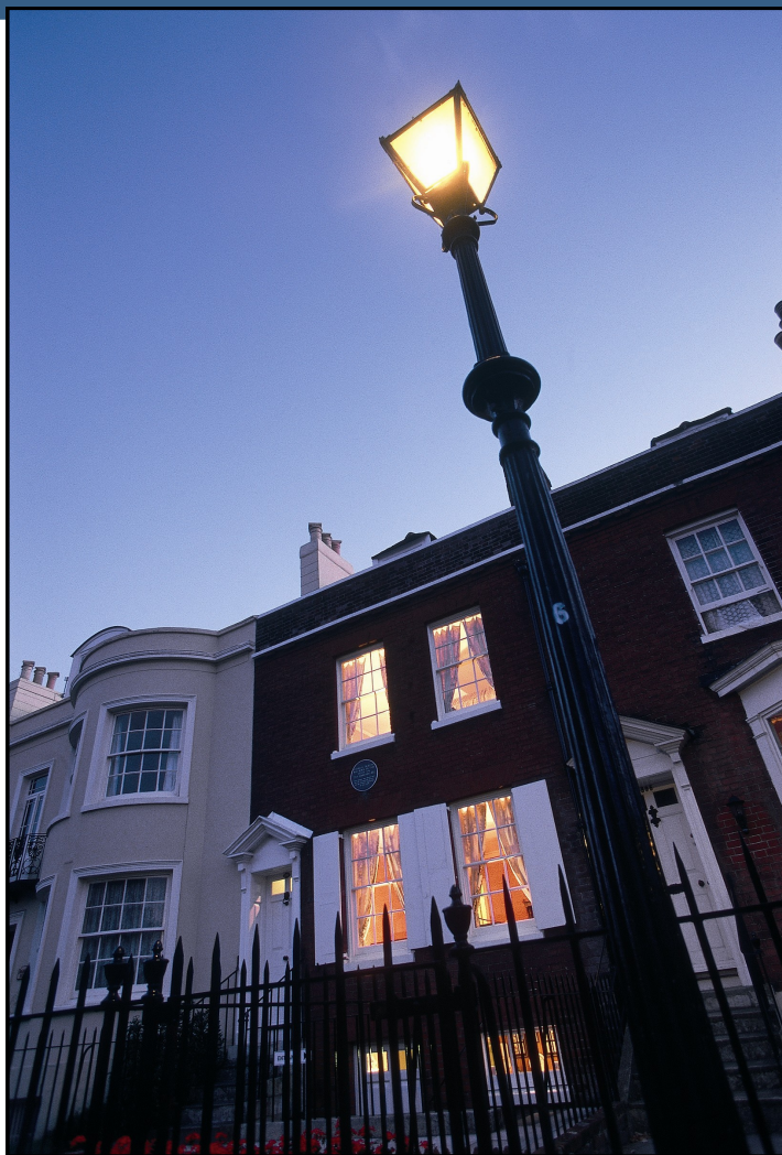
Charles Dickens Birthplace Museum

Tel: 023 9283 4636 Fax: 023 9283 4159 Email: vis@portsmouthcc.gov.uk Trade Web address: www.visitportsmouth.co.uk